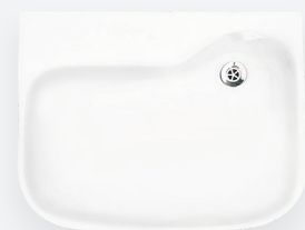
560B STERISAN® Wall Mounted 560mm Type B Clinical Basin with NANO Glazing and Offset Waste