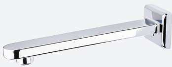
PLUS2500BM GPURE® SMARTEC PLUS Wall Mounted Electronic Tap with Laser Sensor and Battery & Mains Power