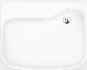
610B STERISAN® Wall Mounted 610mm Type A Clinical Scrub Basin with NANO Glazing and Offset Waste