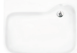
610B Type A Basin