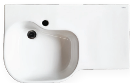
715BRT Ensuite & Accessible Basin