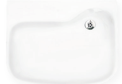
560B Type B Basin

Note: The information provided is only a guide, actual product may differ. The information here should not be relied on without clarification with Gentec. Gentec reserves the right to make design changes at any time without notification. *Subject to terms and conditions, available at https://gentecaustralia.com.au/terms-and-conditions/