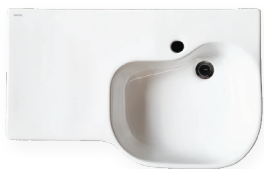
715BLT Ensuite & Accessible Basin